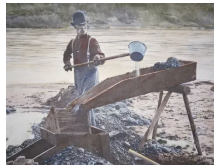
Photo from Anonymous 19 th century photographer showing a unique hand built sluice. From National Archives. Colorized