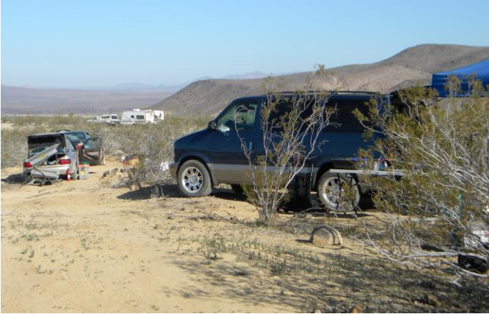
MEMBERS DIGGING FOR GOLD