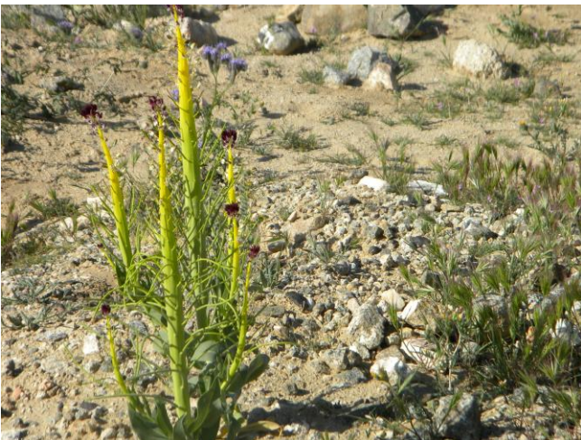
Wild flowers in bloom