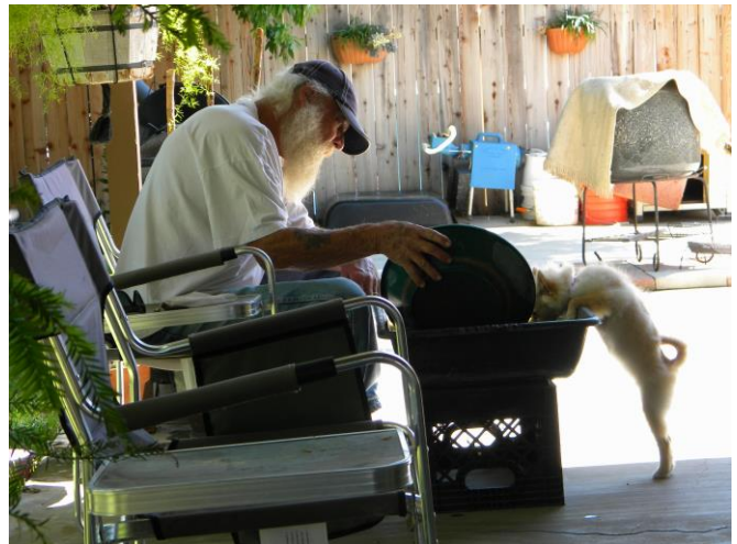
Gold Sniffing Dog in training