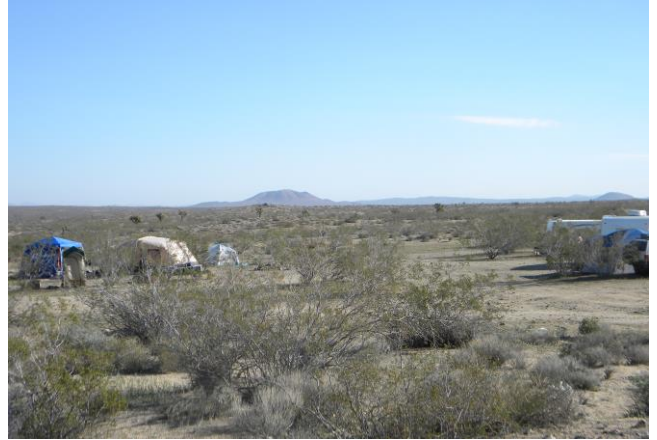
MEMBERS LOOKING FOR A BIG NUGGEY