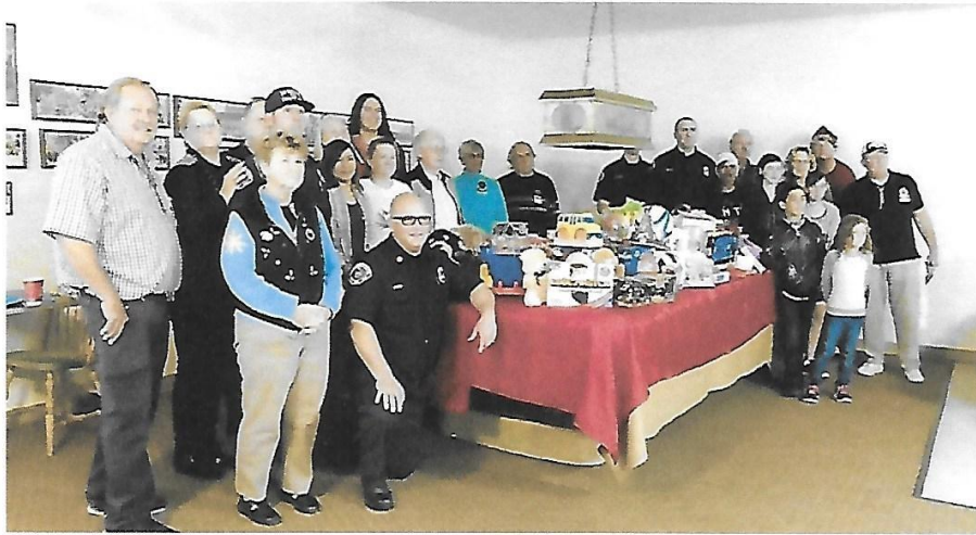
Fireman picking up presents for the kids Christmas