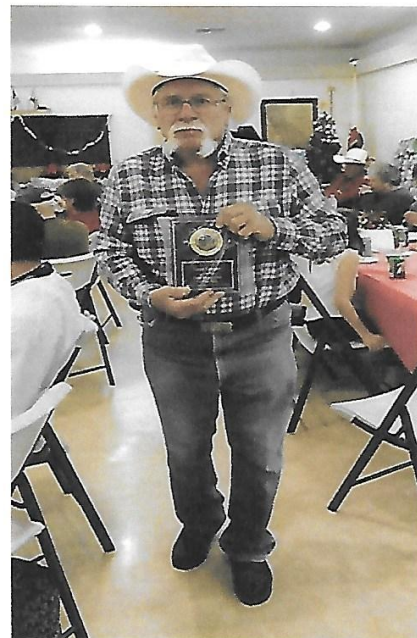
Prospector of the yr. 2016