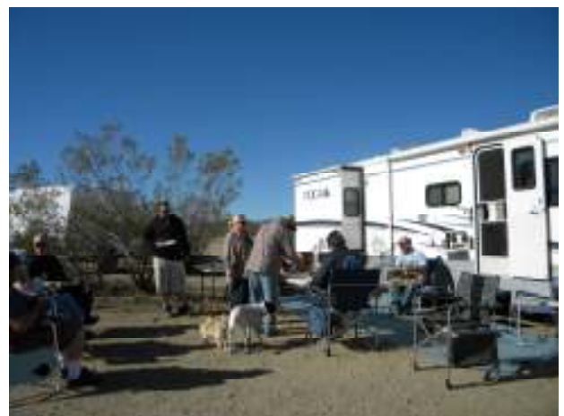
Chirozzo & Eggs fro Breakfast at the out