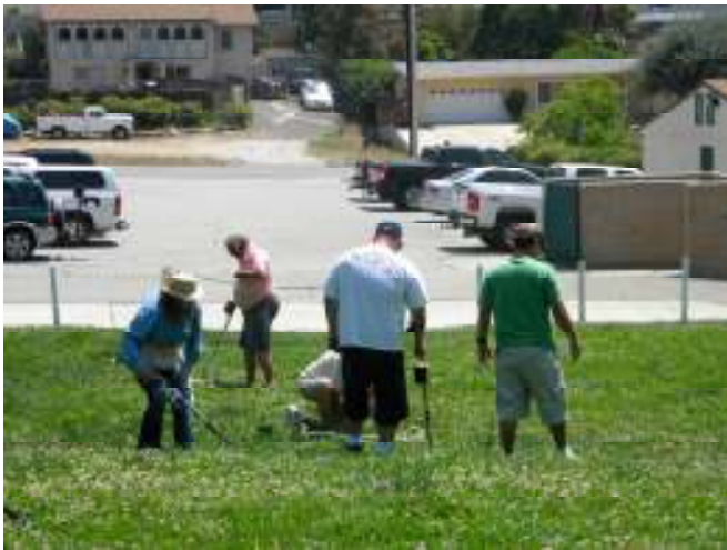
Metal Detecting for all ages.