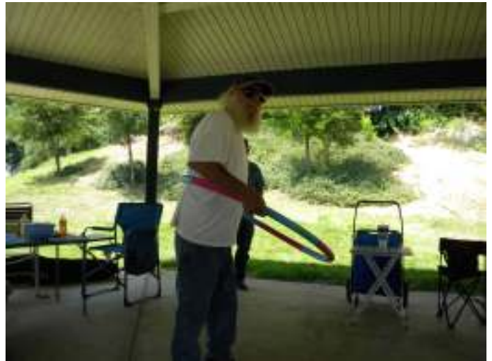
One person tried the Hula Hoop Contest