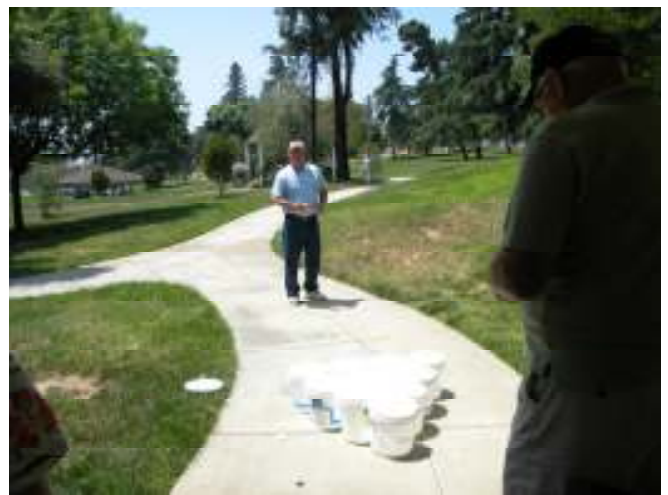
Bucket Contest was fun