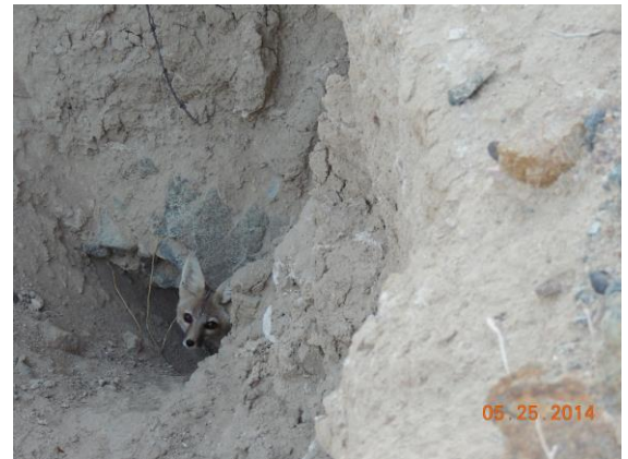
Do Not Disturb