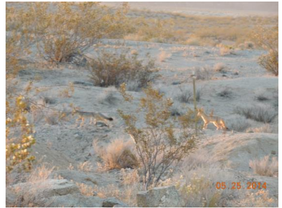
Follow the leader