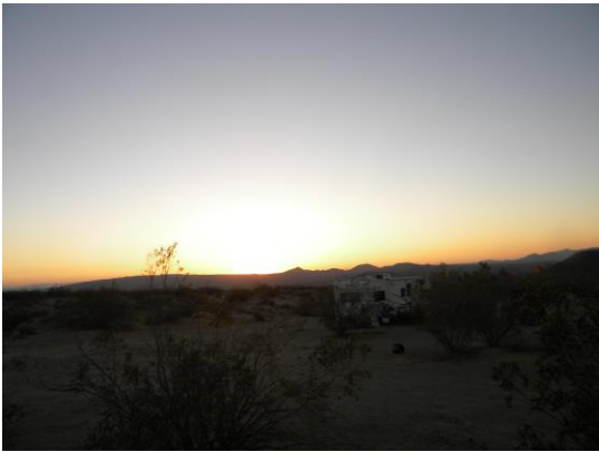
Beautiful Sunset at Coolgardie