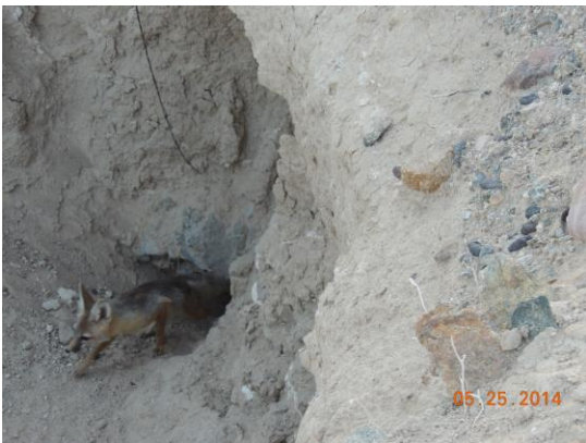
Can I come out now