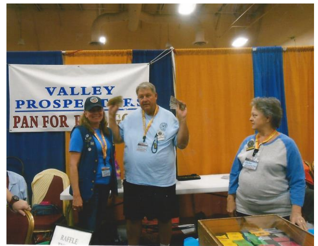
See what I won