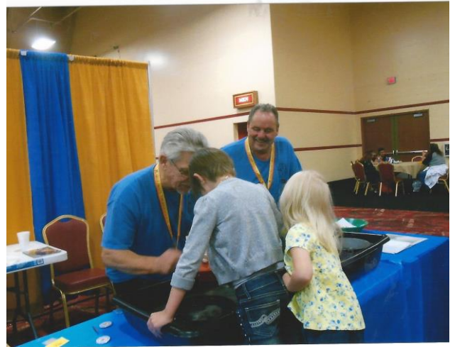
See the gold