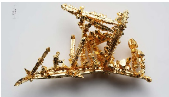
Gold created in a lab

The first U.S. Gold Rush was in Georgia in 1828, followed by California in 1849, Colorado in 1859, South Dakota in 1874, Alaska in 1898, and Nevada in 1902 (the famous Comstock discovery in 1859 was Silver). Some regions of Arizona have been mined for Gold for more than 600 years. Indians mined Gold in 1565 to trade with Spanish Conquistadors in Florida.